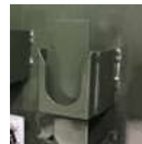
5. Parking Stand