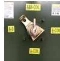
2. Load break Switch